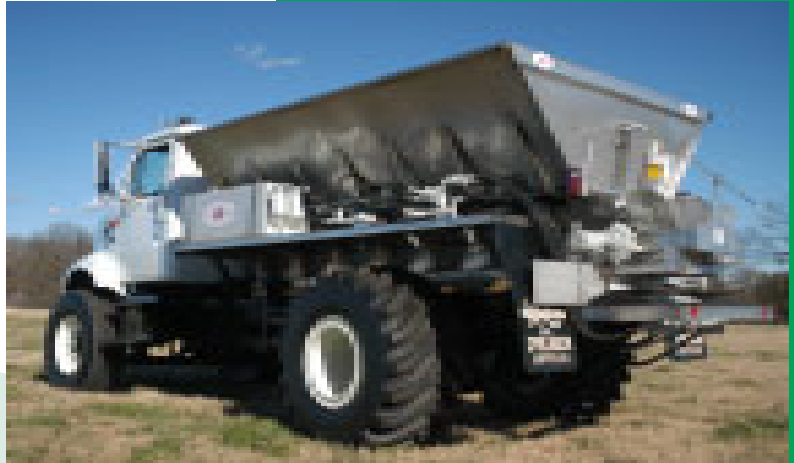
FLARE BODY WITH FLOATATION TIRES

Newton Crouch Spreaders utilize many common, everyday parts therefore making NCI Spreaders field serviceable and the most practical choice in the market.