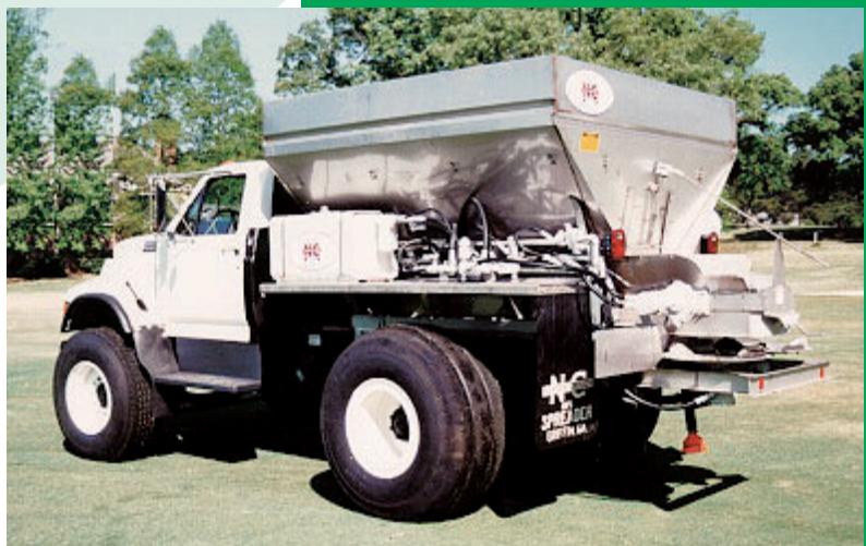
HIGH SIDE TURF