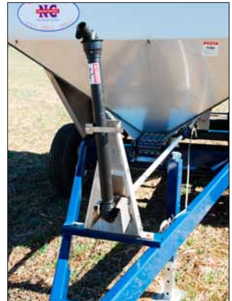
Stainless PTO Stand Powder-Coated Frame