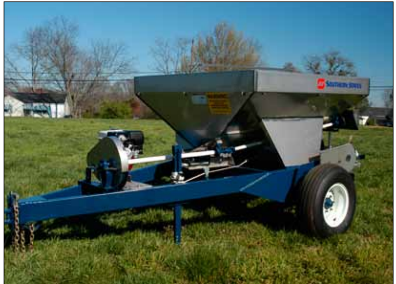
Optional Drives Gas Motor or Hydraulic