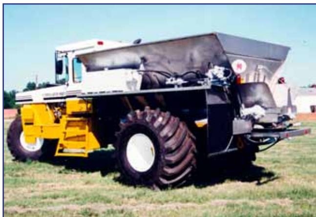
12 Foot Unit for Terra Gator