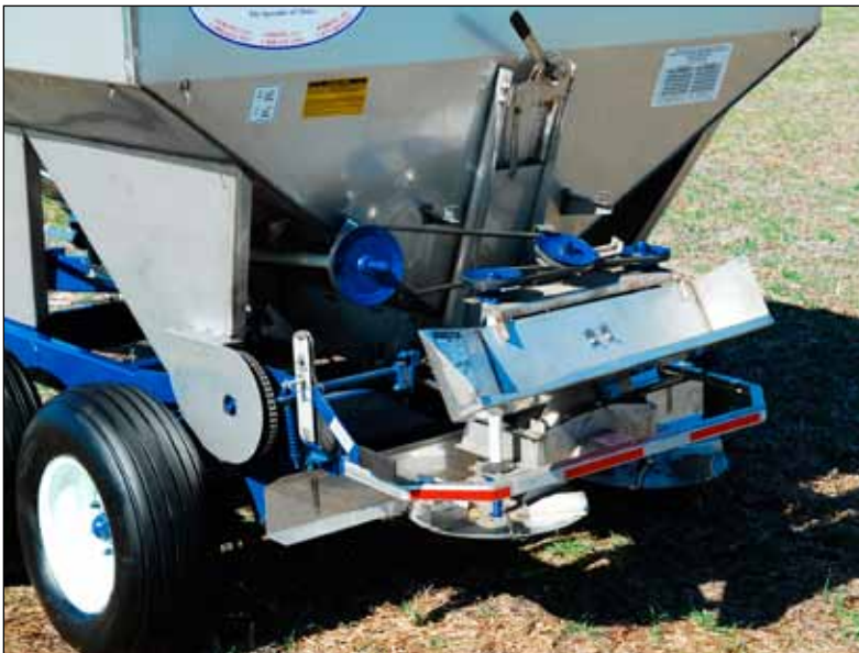
50 Foot Spread Pattern for Lower Cost Per Acre