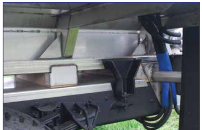
Belly Pan with Oak Boards