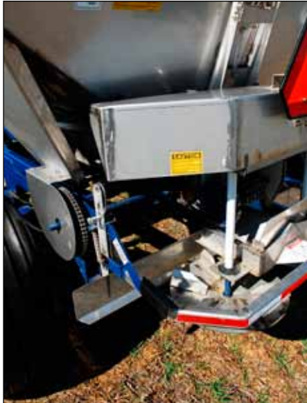
Positive Engagement Wheel Lock, Stainless Dishes, Less Parts