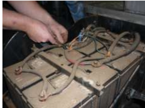
Completely remove wiring and battery connections