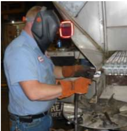
Wear protective gear when welding