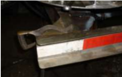
Place a ground on the truck bumper

When welding on a truck unit, batteries MUST be disconnected. Failure to do this may “blow” any electronics installed in your truck!!