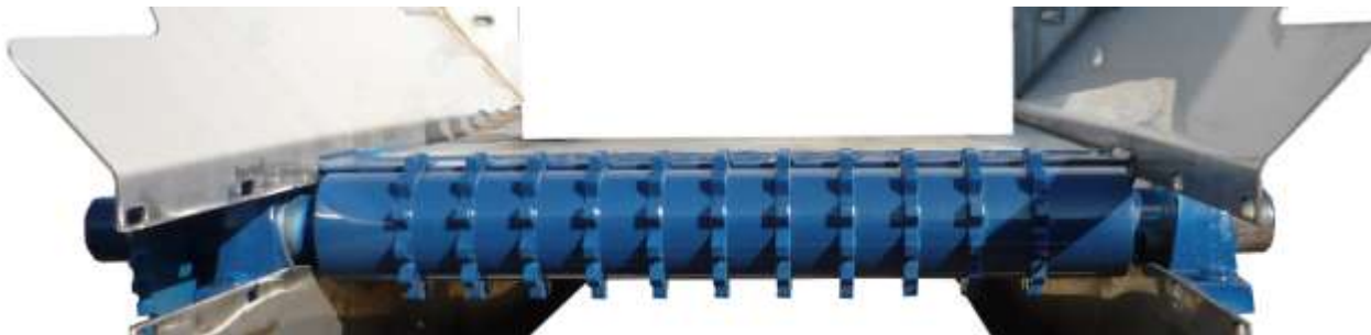
Roller shown is for 24" Clinched Pin Chain