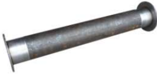
Front Roller (shown without shaft)

Front Rollers ARE interchangeable and can be used with either clinched or straight pin chains: CN-015005R for 16" chain CN-015005M for 24" chain