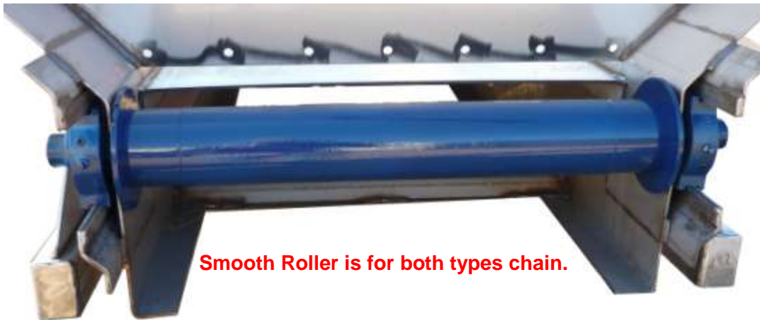
Smooth Roller is for both types chain.