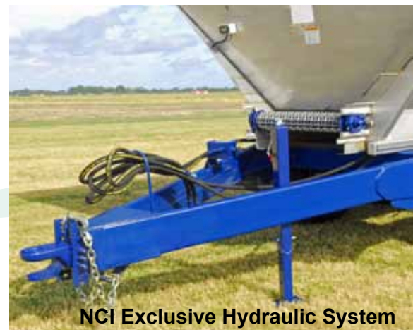
NCI Exclusive Hydraulic System

Manufactured heavier...sturdier and stronger... with more 304 stainless steel... a design that's easier to operate and maintain.