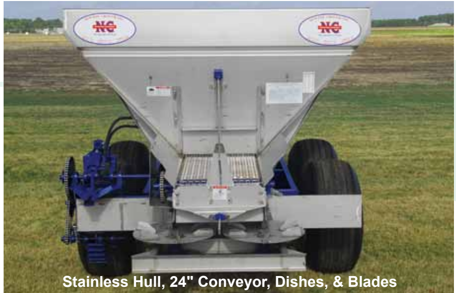
Stainless Hull, 24" Conveyor, Dishes, & Blades

Designed and built stronger to last longer.