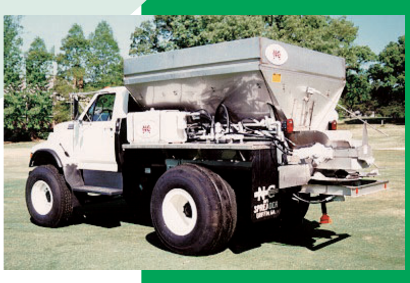
HIGH SIDE TURF