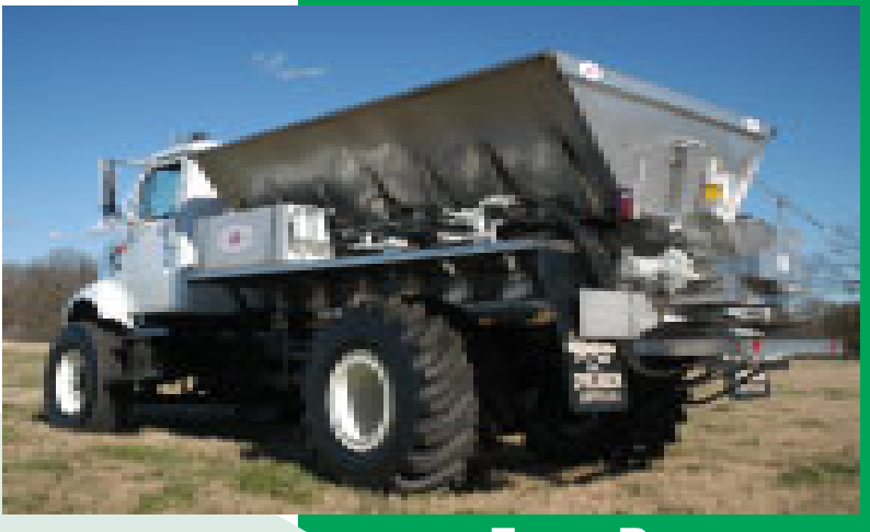
FLARE BODY WITH FLOATATION TIRES

Newton Crouch Spreaders utilize many common, everyday parts therefore making NCI Spreaders field serviceable and the most practical choice in the market.