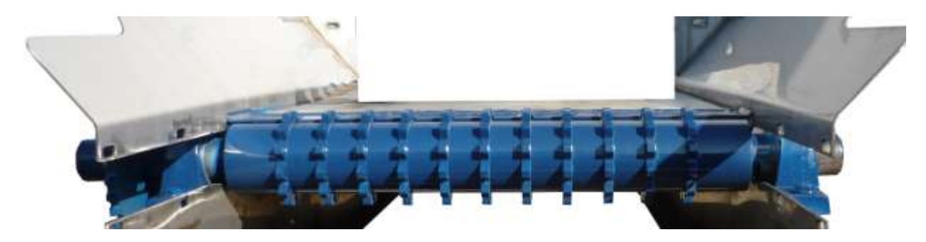
Roller shown is for 24" Clinched Pin Chain