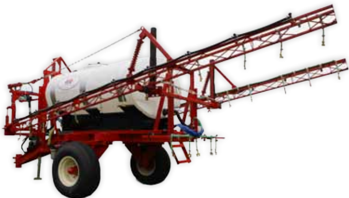
Model 45 Onion Sprayer Designed for Higher Pressure & Flows