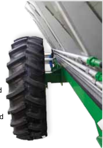
Adjustable Wheel Spacing