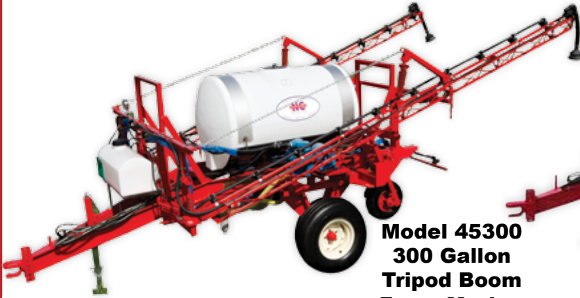
Model 45300 300 Gallon Tripod Boom Foam Marker