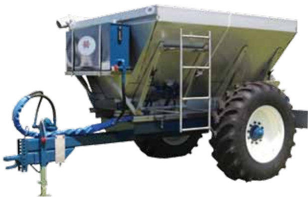
Custom Spreader with Tractor Tires Self contained hydraulic system, ladder, 380/ 90 R-36 tractor tires