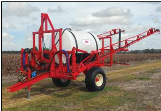
Model 45500 with Truss Boom Truss Boom width up to 60 foot Turtle Back Design for Heavy Duty Use