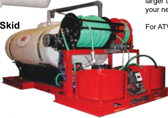
300 Gallon Skid