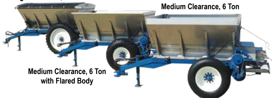
Medium Clearance, 6 Ton