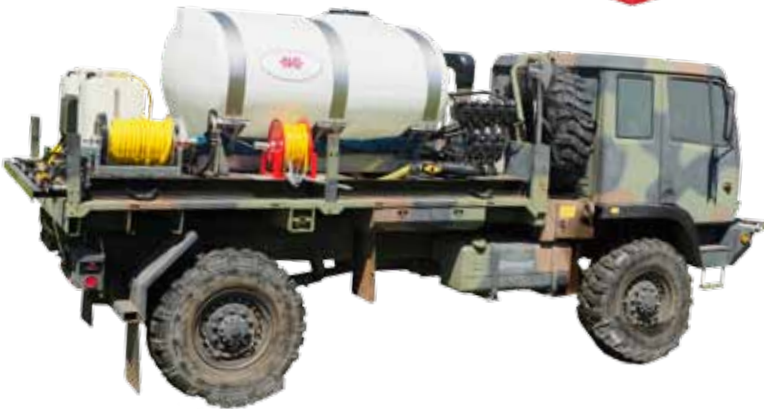
750 Gallon Skid