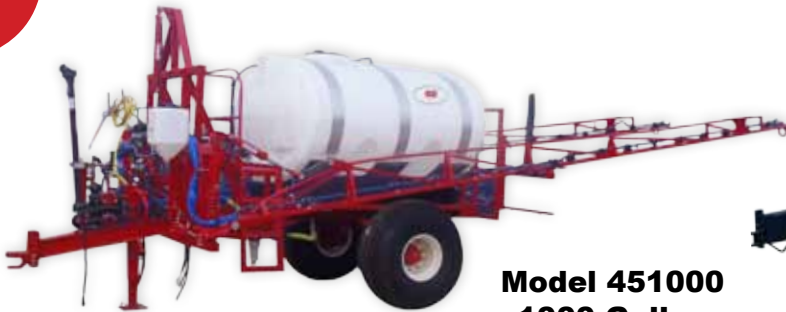
Model 451000 1000 Gallon