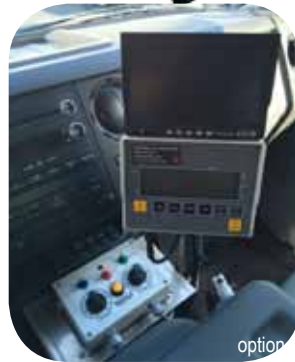
Digital Scale & Camera