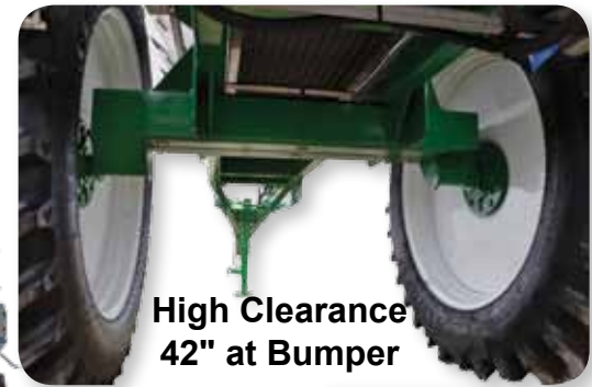
High Clearance 42" at Bumper