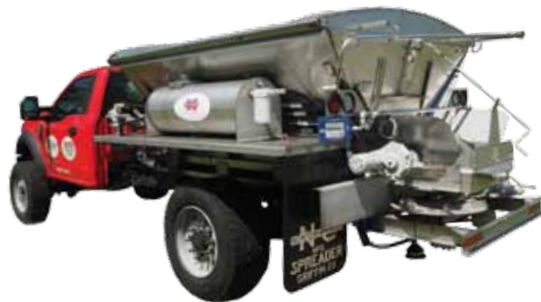
Golf Course Truck Spreader Split chain for around greens and sand traps. Picture shows options: stainless oil tank, flared hull with end caps for side to side tarp, and flotation tires. NCI will customize spreader depending on your needs.