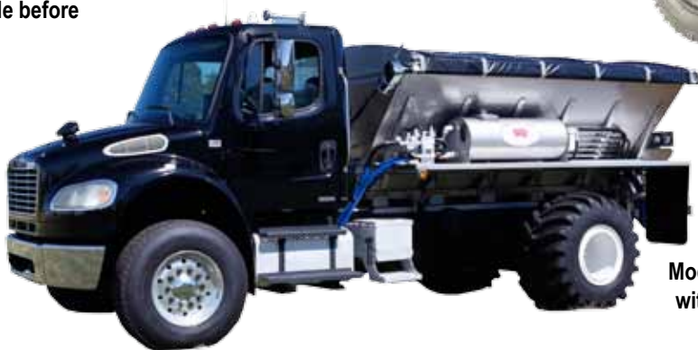
Modern Spreader Truck with Controller Driven

Its been our honor to serve our customers and the ag industry since 1940. Thank you for trusting us with your business!