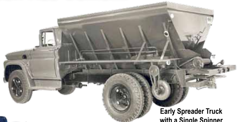
Early Spreader Truck with a Single Spinner