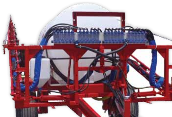
Model 45 with VisaFlow 500 Gallon Row Crop Sprayer