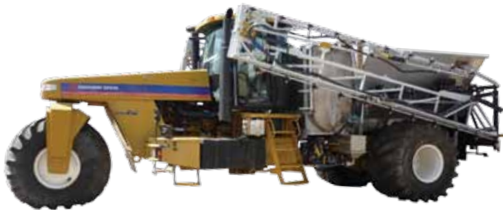
Model 55 Combination - Dry/Liquid Unit 9' 304 stainless steel hull, 16" stainless clinched chain conveyor, 700 gallon tank with booms and dry spreader, can be fitted with controller and guidance for both liquid and dry sections of unit