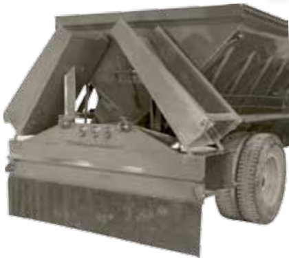
Early Spreader Truck Style before Spinner Dishes