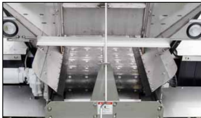
Optional Belt-Over-Chain 304 stainless steel fasteners and chain guards, no epoxy used to fill gaps on NCI's BOC model. Will spread treblock lime. Available on model 54 and some pull types.