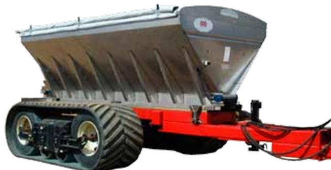
Tandem Axle Spreader with Tracks 16' 304 stainless hull, controller driven spinners and conveyor