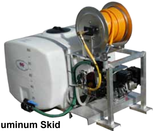
100 Gallon Aluminum Skid