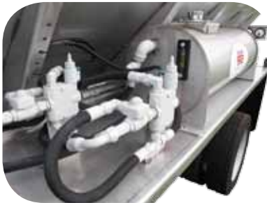
Oil Tank with Sight Gauge