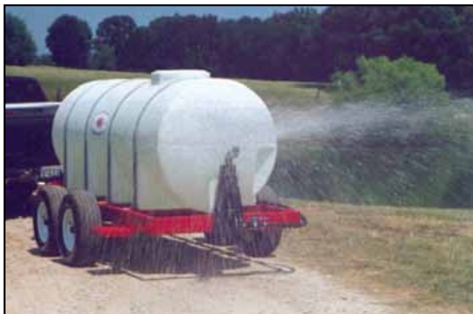
Model 56 Nurse Tank with Roadway Nozzle Designed for Wetting Roads, Turf & Various Applications Other Custom Designs Available