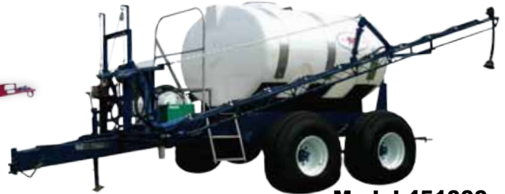
Model 451000 1000 Gallon