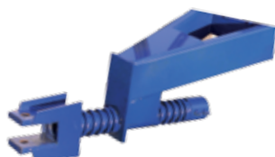
Swivel with Spring Hitch Reduces Shock to the Tractor

Axes on medium and high clearance row crops are tucked in so you can spread on growing plants without damaging new growth.