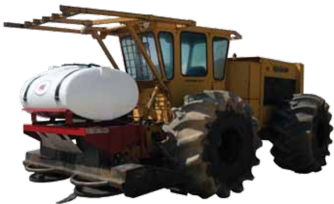
Special Design for Forestry Elliptical Tank on Stainless Skid, Custom Design