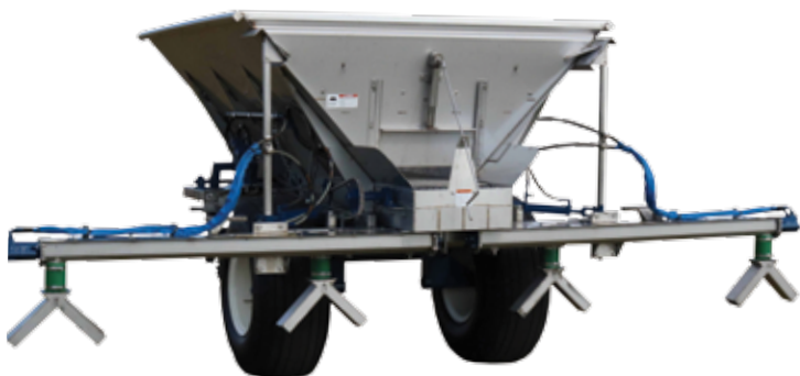
Sugar Cane Medium Clearance Spreader with Augers 9' x 98" 304 stainless hull, flared body, tractor hydraulics 6 hose system, 24" stainless clinched chain conveyor, tube trailer frame, 4 augers with hydraulic cylinders, flotation tires