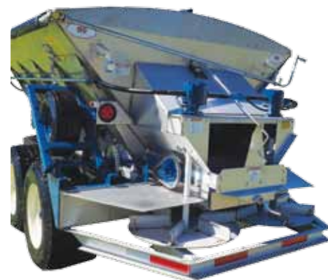
Heavy Duty 30" Dishes

See features of Newton Crouch Inc's PLT Spreader. Use your phone camera to follow QR code.