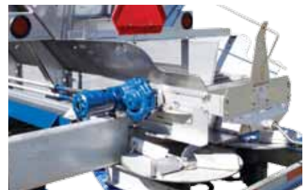
Extended Range Dishes