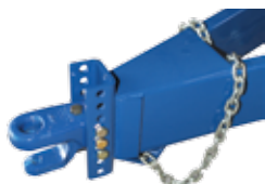
Cat 3 Pintle/Clevis Hitch Standard on Model 47NC Spreadit & Spreadit Jr.