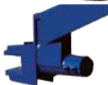
Category 3 Swivel Hitch Standard on Model 49 Medium Clearance