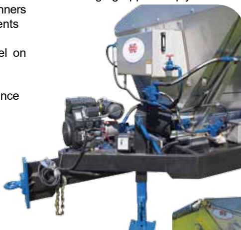
Self Contained Hydraulics with Gas Engine