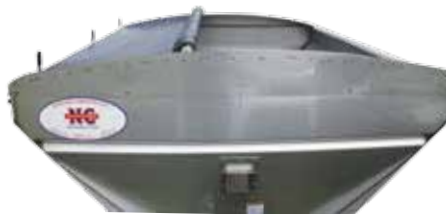
Side to Side Tarp with Ridge Pole and Stainless End Caps