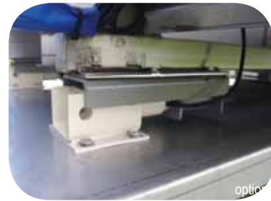
Scale Bracket Tie Downs