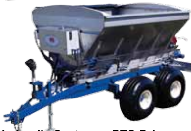
Hydraulic Systems - PTO Driven

Fertilizer/Lime, 10 foot x 102 inch 304 stainless hull, tandem axle with 19L tires, 10 bolt hub, all hydraulic system, tractor hydraulic spinners and conveyor, four house open/closed valve, minimum 18 gpm, dual remotes, 16" stainless conveyor, trailer frame-tubing, 4x6 raised lift, powder coat paint, color blue, category 3 pintle/clevis hitch, (Also available in PTO)