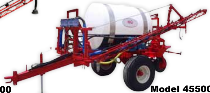
Model 45500 500 Gallon Tripod Boom Visa Flow