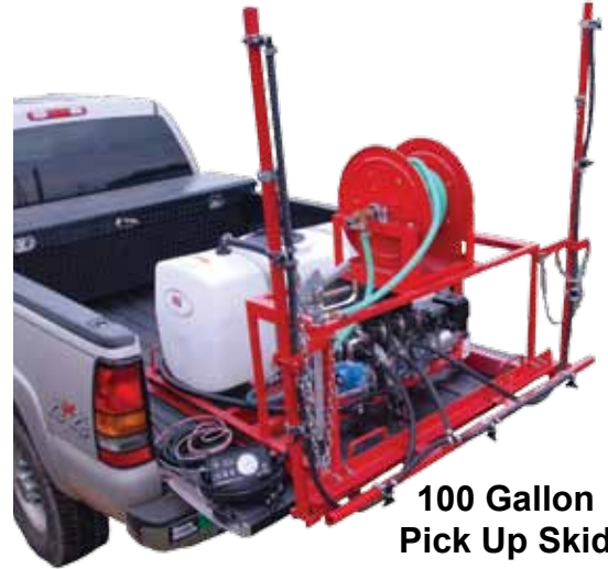
100 Gallon Pick Up Skid