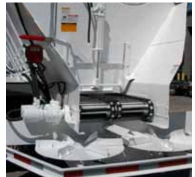
Sludge Spreader with Split Chain Conveyor