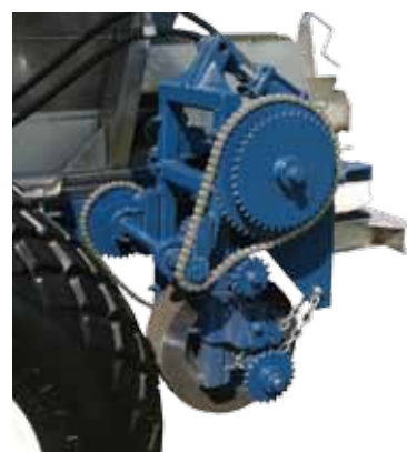
Press Wheel for a Model 49 Medium Clearance Row Crop with Half or Third Rate Kit

Axes on medium and high clearance row crops are tucked in so you can spread on growing plants without damaging new growth.