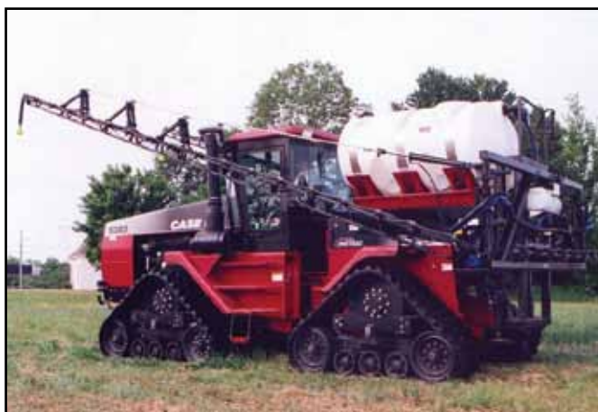
Model 64 Custom Boom and Mount Sprayer