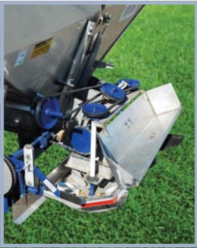
Belt Driven Spinners