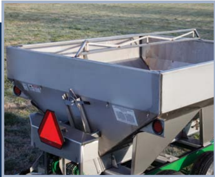
Heavy Duty Tarp Bow Truss in Stainless