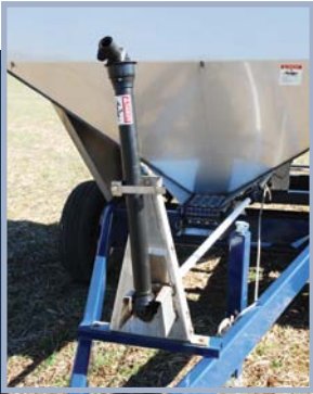
Stainless PTO Stand