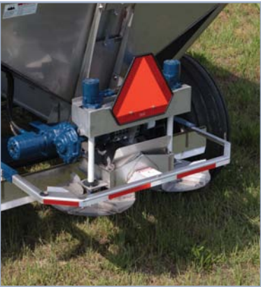
Hydraulic Conveyor and Spinner Motors