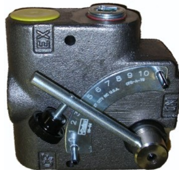
Parker HV-FC5134 (has NPT thread) or HV-FCB5112SAE (has O -ring fittings)

Take needle valve out and polish it. Sometimes this will correct the problem. If the FCV is still frozen, replace it.