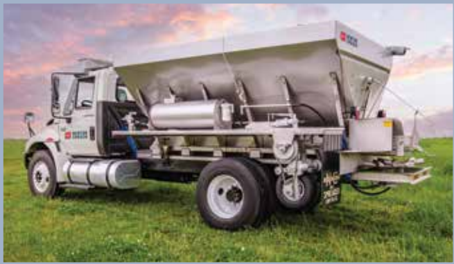
Press Wheel Conveyor