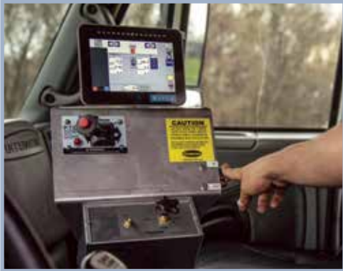
Variety of Controller Options